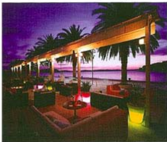
Above: Riva Hotel in Hvar, Croatia. Below: