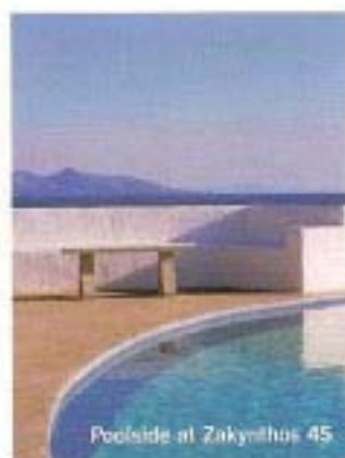
Poolside at Zakynthos 4S

The Rou Estate , near Porta, Corfu (0870 606 0013; www.routravel.co.uk ). From £460 per person a week, based on six people sharing, including flights, transfers, maid service and a food hamper on arrival