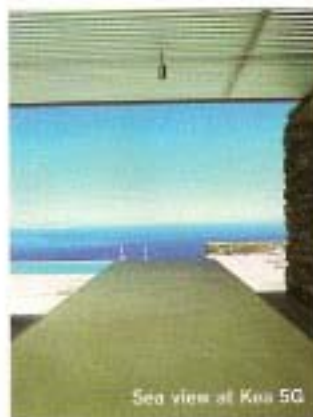
Sea view at Kea 5G

Although a popular weekend stopover with Athenian yachts, Kea is well off the tour operator map – which makes this rugged island, an hour's ferry ride from Athens, doubly appealing. The sharp edges and cool, clean interiors of the Kea 5G hilltop villa (a modern take on Cycladic architecture) are a perfect foil to the sun-baked landscape. Walls of slate-grey stone, brushed concrete floors and all-white furniture provide a striking contrast to the surrounding blue of the sea and sky. The villa sleeps eight people and is divided into two wings (connected by a pergola) for maximum privacy. There is a barbecue and sunken seating where guests can gather at sunset. Modern comforts include surround-sound stereo throughout, an espresso