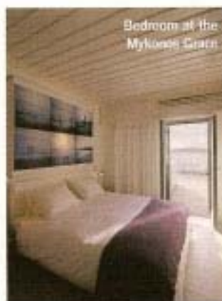
Bedroom at the Mykonos Grace

Grace is the word at this clean-cut bathhouse on the sandy bay of Agios Stefanos, north of Mykonos harbour.